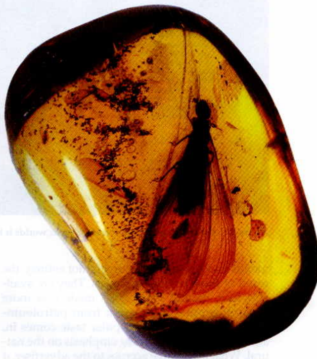
Figure 3. Extinct termite, Mastotermes electrodominicus , included in Dominican amber is the kind of piece prized for its rarity and the possibility of extracting ancient DNA.

The forgers responded, adding vanillin labeled in a specific way with ^{13}\text{C} . Economical, not lazy, they did not spread out the isotope over the whole molecule, as would be expected in a natural product. They just put it in where it was cheapest to put it, in the one \text{CH}_3 group of the molecule.